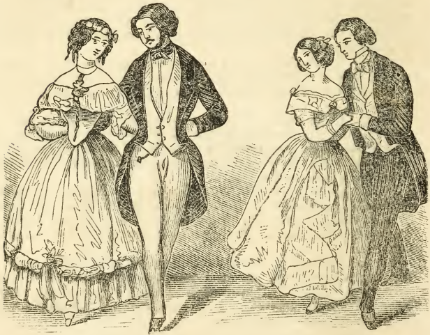
THE POLKA AND QUADRILLE MAZURKA STEP.

First couple polka inside — next couple the same — next — next — first and second couple polka round each other — second and third — third and fourth — fourth and first — all polka around the hall.